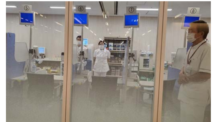
Blood collection department

All staff are required to wear masks and measure the temperature.